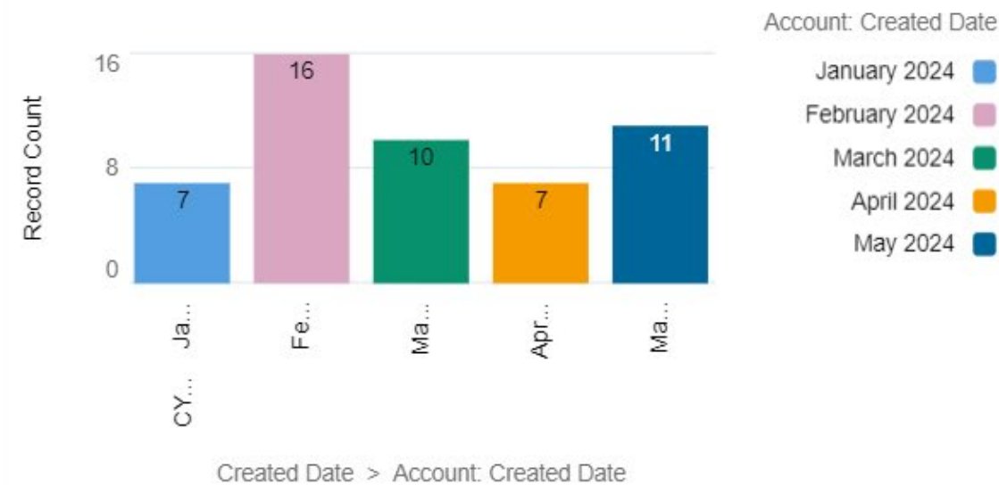
Applications received by new Applicants

View Report (Month with the most applications)